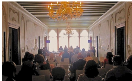
Palazzo Ca' Giustinian in Venice