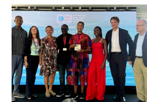
The winners of the 36th Enrico Fulchignoni Award with the jurors