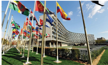
UNESCO Headquarters in Paris, France