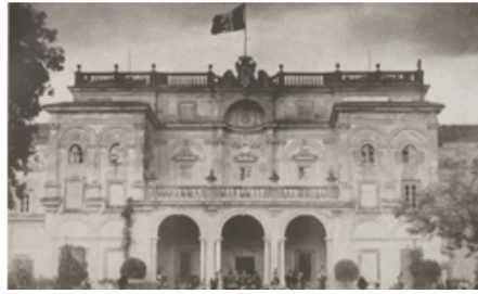
Villa Falconeri, inauguration of Istituto Internazionale per la Cinematografia Educativa