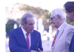
34th Enrico Fulchignoni Award Ceremony, Winner: "Nuclear" by Oliver Stone

CICT ICFT has contributed to the creation of several Film Festivals , including Cannes FF , Venice FF , Berlin International FF , Moscow International FF , Tirana FF (TIFF) , Ohrid FF , Zagreb FF , Beirut International FF , Izmir Short FF , Festival International du Cinéma Africain de Khouribga , Gaza FF , Damascus International FF , Cairo International FF , Tripoli FF , Kalamata FF , Menorca FF , Hammamet FF , Festival international du film de Marrakech , Antalya FF , and Signs of Change FF at Tribeca and UNHQ, New York .